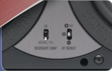
Boundary Compensation and High Frequency Energy switches