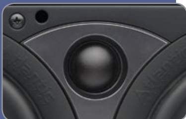
AT's renowned LRT™ soft-dome tweeter