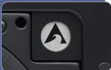
Punchout for use with IR Receivers**