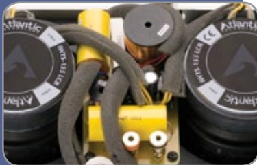
Sophisticated audiophile crossover