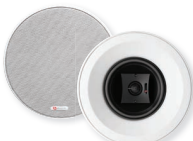
HSi 470 2-Way 6½-In-Ceiling Speaker