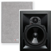
HSi 475 2-Way 6½-In-Wall Speaker