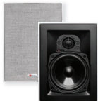
HSi 455 2-Way 5¼-In-Wall Speaker