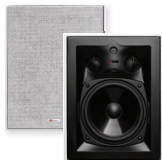
HSi 475T2 6 1/2" Stereo In-Wall Speaker