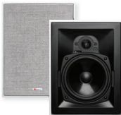
HSi 275 2-Way 6½-In-Wall Speaker