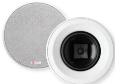
HSi 480 2-Way 8-In-Ceiling Speaker