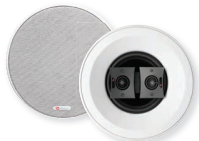
HSi 470T2 6 1/2" Stereo In-Ceiling Speaker