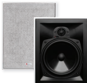
HSi 485 2-Way 8-In-Wall Speaker