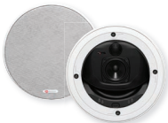
HSi 4830 3-Way 8" In-Ceiling Speaker