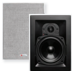
HSi 255 2-Way 5¼-In-Wall Speaker