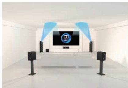
5.1.2 – version with 2 x Q50a