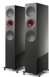
Titanium Gloss Special Edition (Exclusive for R7 Meta)