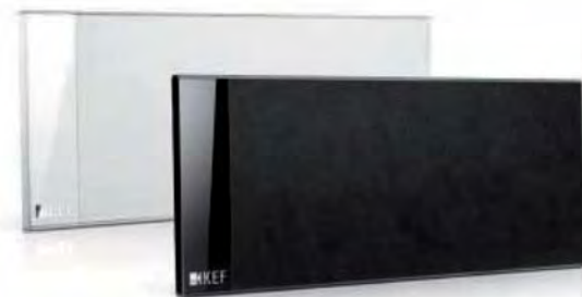
T101 and T101c speakers.

Mounted vertically as satellites (whether wall-mounted, on the desk stands supplied or the optional floor stands) or horizontally as a centre channel above or below the TV, the standard T Series speaker features KEF's new 115mm (4.5in.) ultra-low profile bass and midrange driver paired with the high performance new 25mm (1in.) vented tweeter.