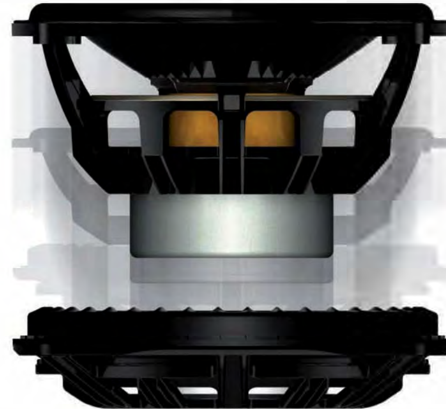
KEF's patented ultra-slim bass driver

Instead of a cone, the radical new twin-layer bass and midrange unit has a flat diaphragm whose rigidity throughout the frequency range is maintained by very fine stiffening ribs, with the driver as a whole acting as a stressed member to help eliminate any unwanted resonance from the slim cabinet. The resulting response is as clean, accurate and distortion-free as a quality conventional speaker, with none of the bulk.