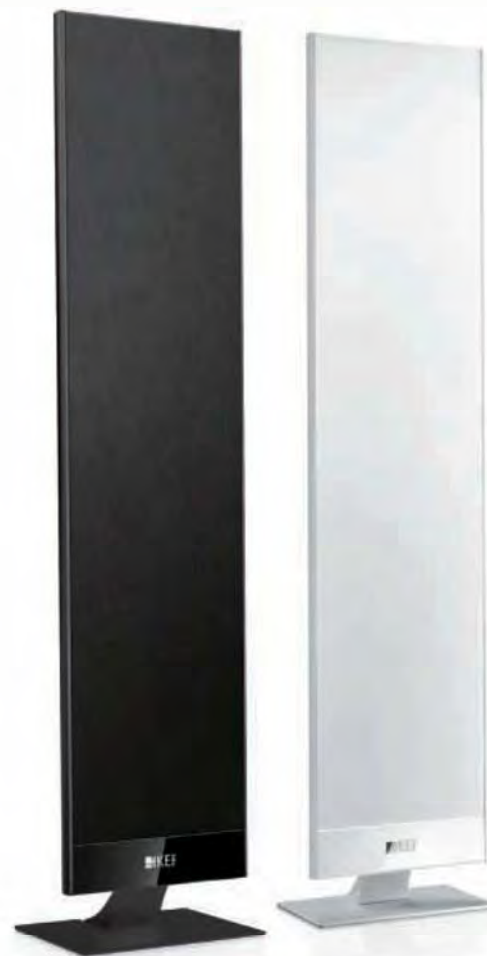
T301 and T301c speakers.

Mounted vertically as satellites (whether wall-mounted, on the desk stands supplied or the optional floor stands) or horizontally as a centre channel above or below the TV, the standard T Series speaker features KEF's new 115mm (4.5in.) ultra-low profile bass and midrange driver paired with the high performance new 25mm (1in.) vented tweeter.