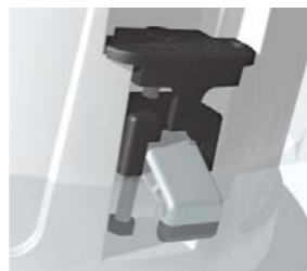
Our in-ceiling SmartLoc™ system offers quick and easy installation

accessories or a separate mounting kit. A mechanical isolation system prevents re-radiation from the mounting wall – so often a problem with custom install designs – allowing the drivers to operate to their full potential whatever their situation.