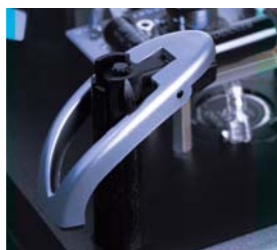
Avant architect in-wall SmartLoc™

SmartLoc is unique to Avant architect™. This patent-pending clamping system enables quick and easy mounting with minimal disruption to existing décor. The entire range can be accommodated in virtually all partition walls without the need for fitting