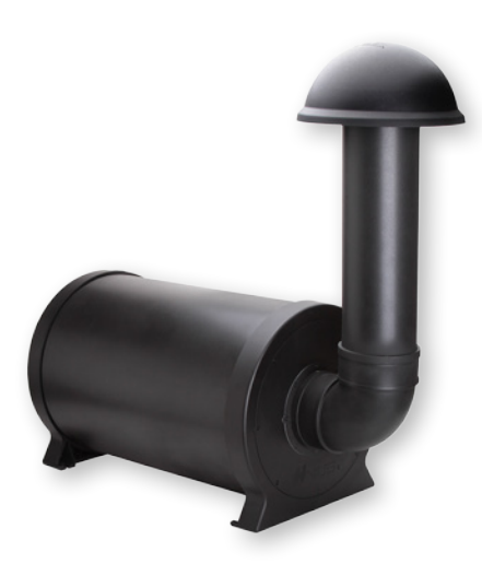
Packaged individually Stock Number FG01668