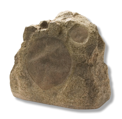
Rock Speakers are available in 5 colors: