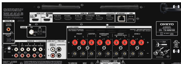
Text on receiver may vary with region.