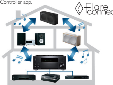
r external input availability visit <a href="http://www.onkyo.com/flareconnect.">http://www.onkyo.com/flareconnect.</a> Id Onkyo Controller free from the App Store or the Google Play Store

FlareConnect shares audio from network and external audio input sources between compatible components. Enjoy effortless multi-room playback of LP records, CDs, network music services, and more with supported components and speaker systems. Music selection, speaker grouping, and playback management across the home are built into the Onkyo Controller app.