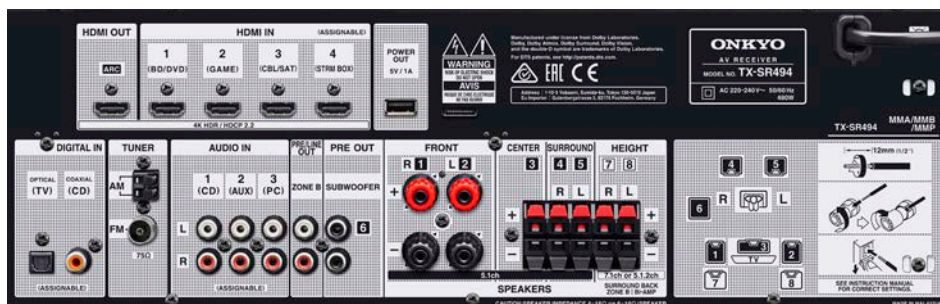
Text on receiver may vary with region.

Due to a policy of continuous product improvement, Onkyo reserves the right to change specifications and appearance without notice. Manufactured under license from Dolby Laboratories. Dolby, the double-D symbol, Dolby Atmos, Dolby Surround, Dolby Vision, and Dolby TrueHD are trademarks of Dolby Laboratories. For DTS patents, see http://patents.dts.com . Manufactured under license from DTS, Inc. DTS, the Symbol, DTS and the Symbol together, DTS:X and the DTS:X logo, DTS Virtual:X and the DTS Virtual:X logo, and DTS-Neural:X and the DTS-Neural:X logo are registered trademarks or trademarks of DTS, Inc. in the United States and/or other countries. © DTS, Inc. All Rights Reserved. The terms HDMI and HDMI High-Definition Multimedia Interface, and the HDMI Logo are trademarks or registered trademarks of HDMI Licensing Administrator, Inc. in the United States and other countries. The Bluetooth® word mark and logos are registered trademarks owned by Bluetooth SIG, Inc. Products displaying the Hi-Res Audio logo conform to the Hi-Res Audio standard as defined by Japan Audio Society. The Hi-Res Audio logo is used under license from Japan Audio Society. AccuEQ and Music Optimizer are trademarks of Onkyo Corporation. All other trademarks and registered trademarks are the property of their respective holders.