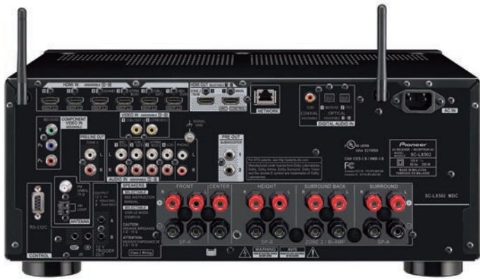
SC-LX502(B) UPC: 889951001003