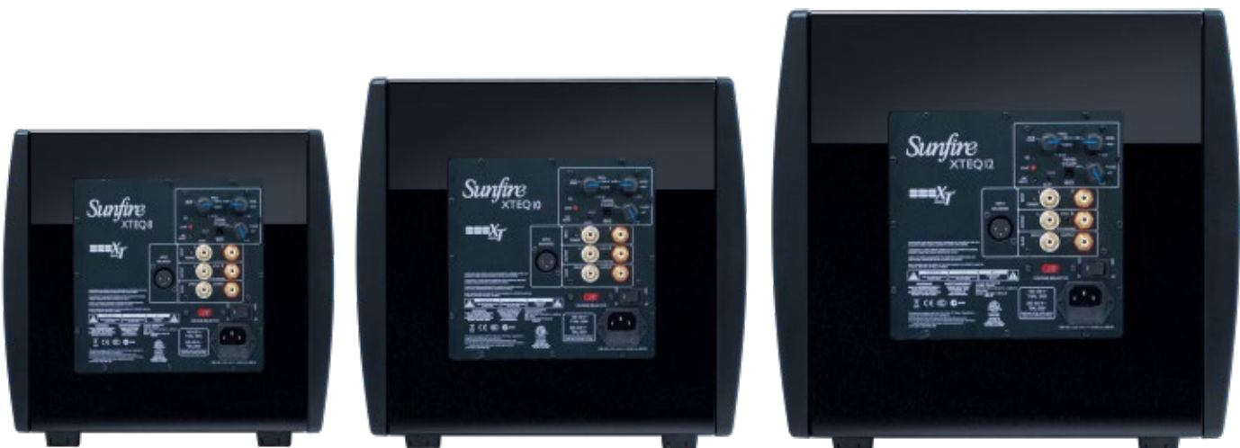
Back panel of XTEQ-8, XTEQ-10 and XTEQ-12