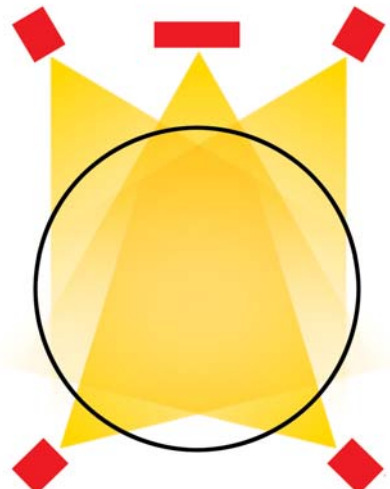
Diamond 9 offers class-leading dispersion, creating a sweetspot that fills the room, and a tonality that is consistent regardless of room type or furnishings.